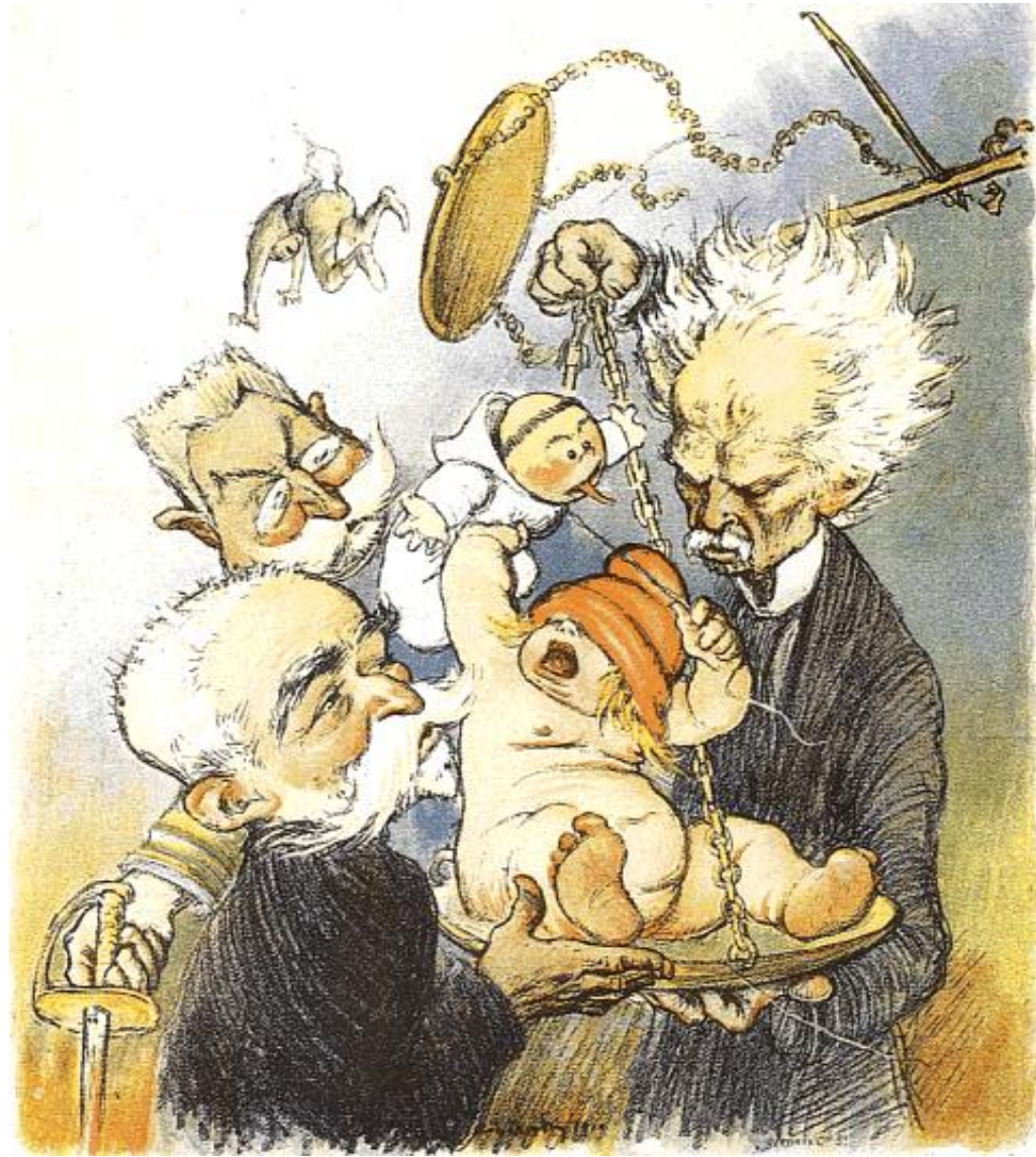
The birth of international justice